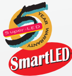
MBCC11JJ ION Super-LED