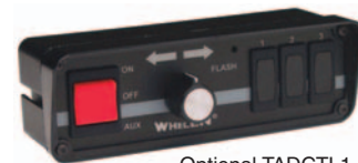
Optional TADCTL1 control head