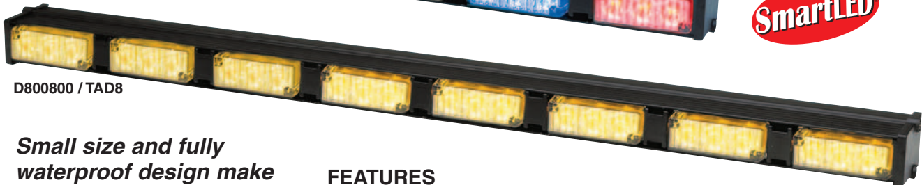
D800800 / TAD8

Small size and fully waterproof design make the Dominator the versatile answer to all your secondary warning and signaling needs.